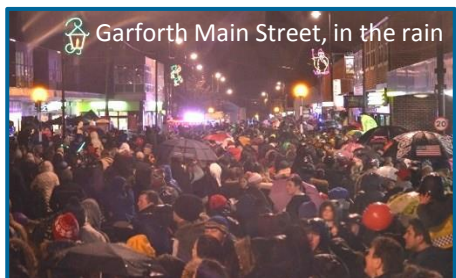
Garforth Main Street, in the rain

6th event and Garforth, with its refreshed format, hosting an impressive line up of young local talent on the entertainment stage, along with some famous faces! The storm may have put some people off attending but Main Street was still teaming with people!