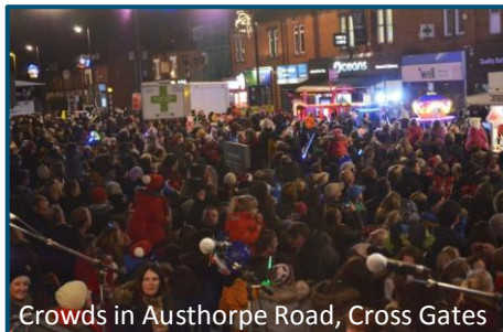
Crowds in Austhorpe Road, Cross Gates

Summary of other work There were also updates on the recent Christmas lights switch-on events the Communities Team has been involved with: Cross Gates on 20 Nov and Garforth on 28 Nov. Both events were well received with Cross Gates recording another record crowd of over 1,000 for its